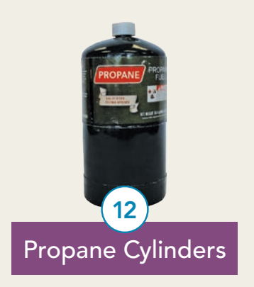
Visit HHW.org for disposal options