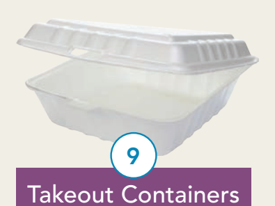
No paper, plastic or foam