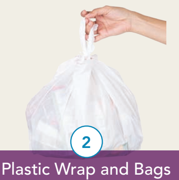
Recycle at retail stores