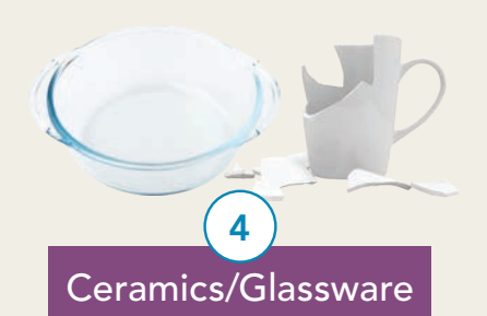
No cookware, serving dishes