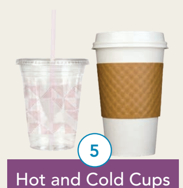
No cup lids or straws