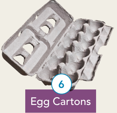
No paper, plastic or foam