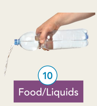
Empty food/liquids from recyclable containers