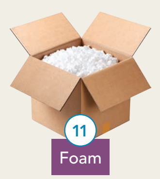
No peanuts, packaging or food trays