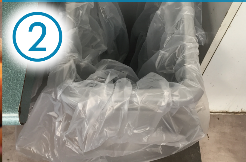
Place in Clear Bag